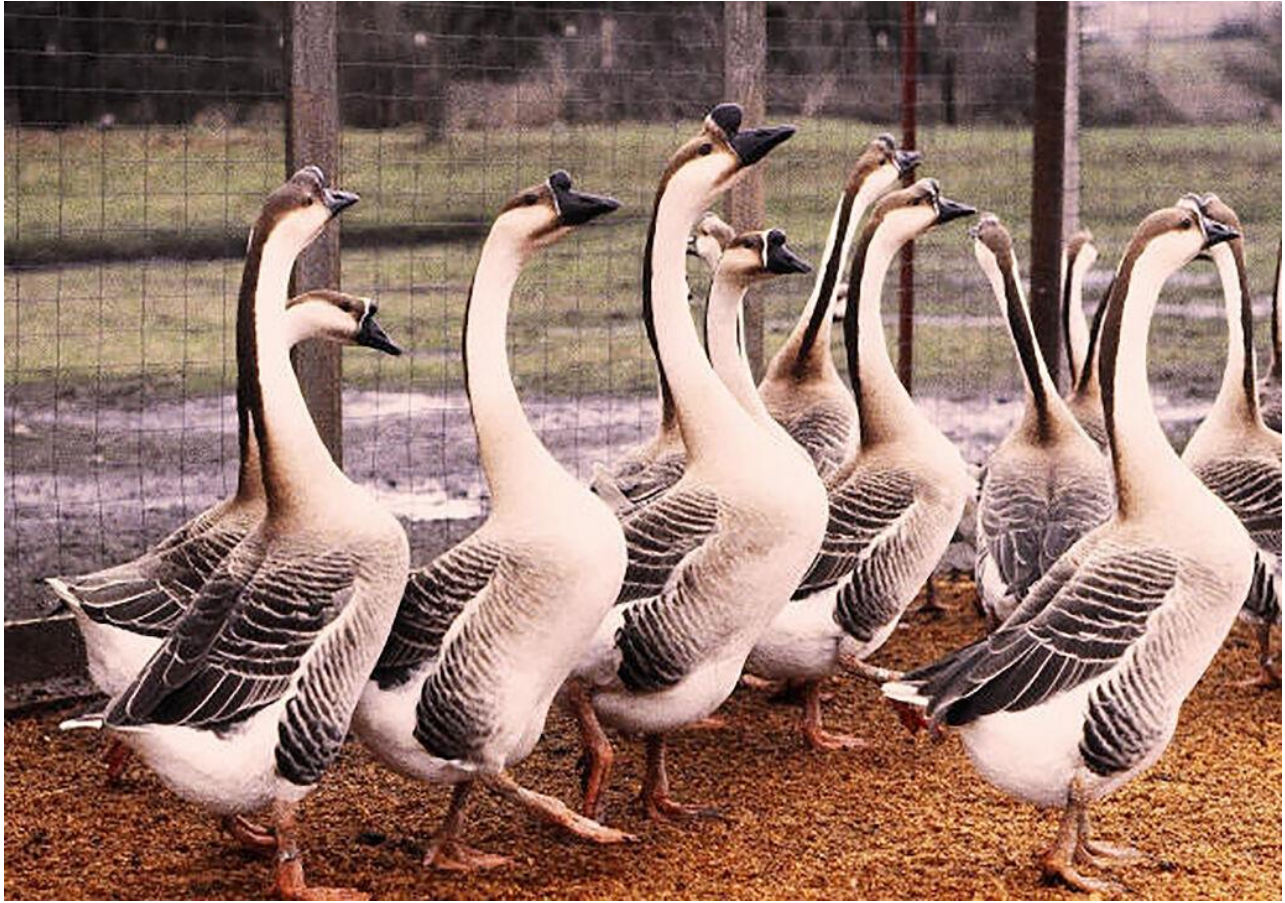
Brown Chinese geese