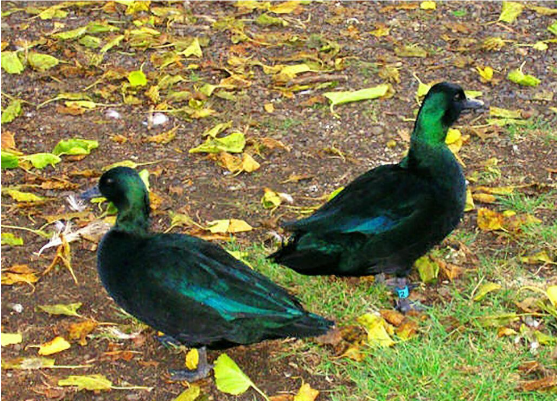
Pair of black East Indie Ducks