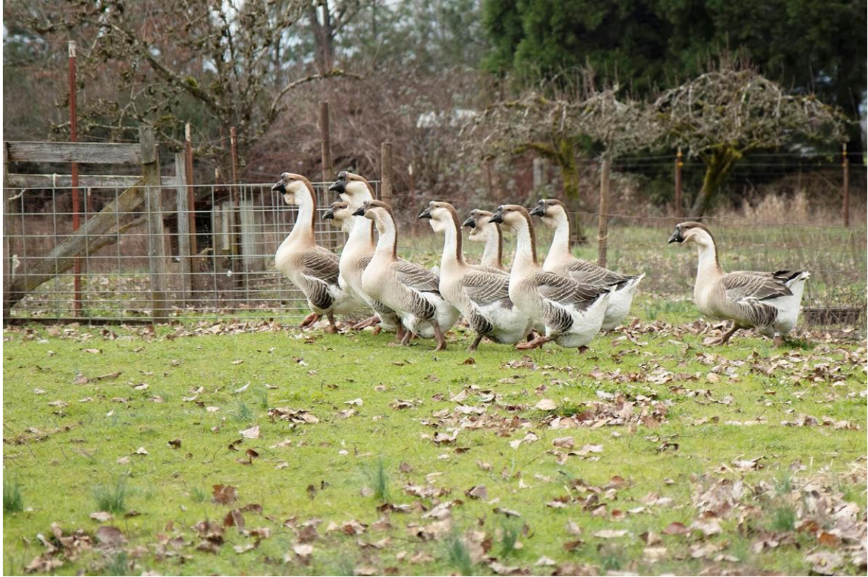
African Geese at the Holderread Waterfowl Farm and Preservation Center.