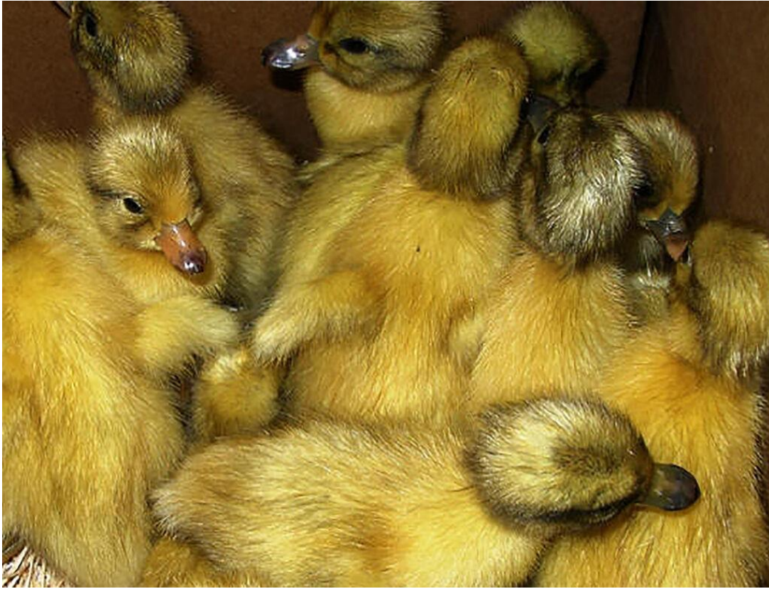
Mini Silver Appleyard ducklings