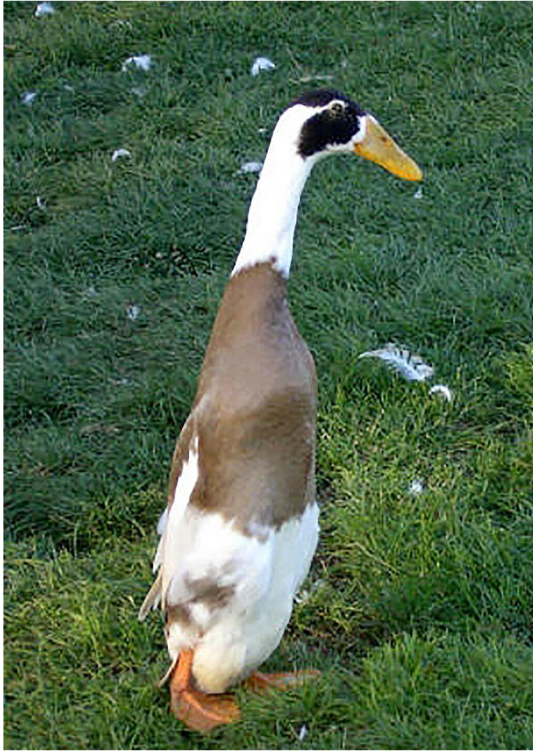
Penciled Runner drake

Around age 8, he got his first clients: Jenks Hatchery Inc. in Talent, Ore., and a local general store both offered to pay him for hatching eggs.